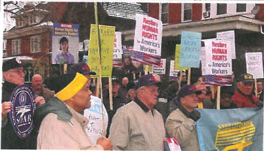
SOAR members rally in Pittsburgh in support for human rights!