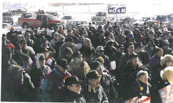
SOAR members participate in a "Stand up for Steel" rally in Chisholm, MN.